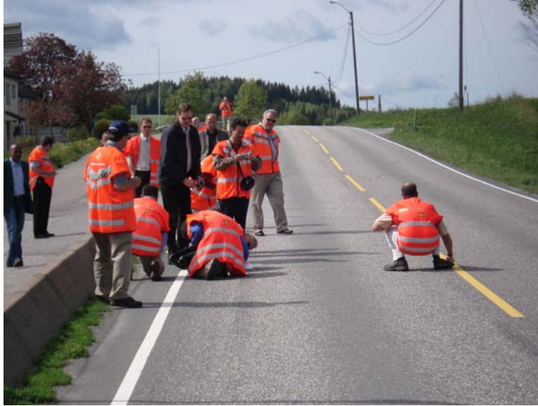
Figure 4. U.S. Scan Team Inspecting WAM-Foam Pavement in Norway

In Germany, laboratory and field performance data was presented on seven WMA test sections being monitored by BASt. In all cases, the test sections had the same or better performance than the HMA control sections (7, 15). In addition, several of the WMA additive suppliers presented performance data on a variety of trial sections, some of them on commercial projects. Again, the performance of the WMA was as good as or better than the HMA (or in some cases HMA that had previously been used at the site). Three of the WMA additives used in Germany, Fischer-Tropsch wax (Sasobit), Montan wax (Asphaltan-B), and fatty acid amides (Licomont BS 100 or Sübit) have the advantage of increasing the stiffness of the binders at high temperatures. The low temperatures in Germany are generally somewhat milder than the northern U.S. (PG xx-22 or warmer). Therefore there is less concern about low temperature cracking.