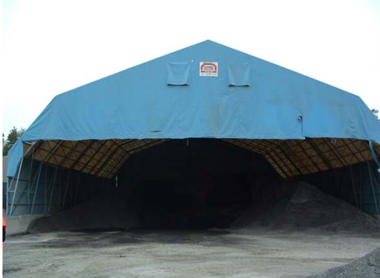
Figure 3. Kolo Veidekke's Covered RAP Storage.

In Norway, the composite moisture content of the aggregates going into Kolo Veidekke’s plant near Ås ranged from 2 to 3 percent. Further, they practiced good material management practices like covering their RAP pile (Figure 3) and their conveyors. In Germany, aggregates with low water absorptions, such as gneisses, granites, and quartzite are generally used. The aggregates used in HMA in every region of France have less than 1 percent water absorption. Lower water absorptions and composite moisture contents make it easier to dry the aggregates.