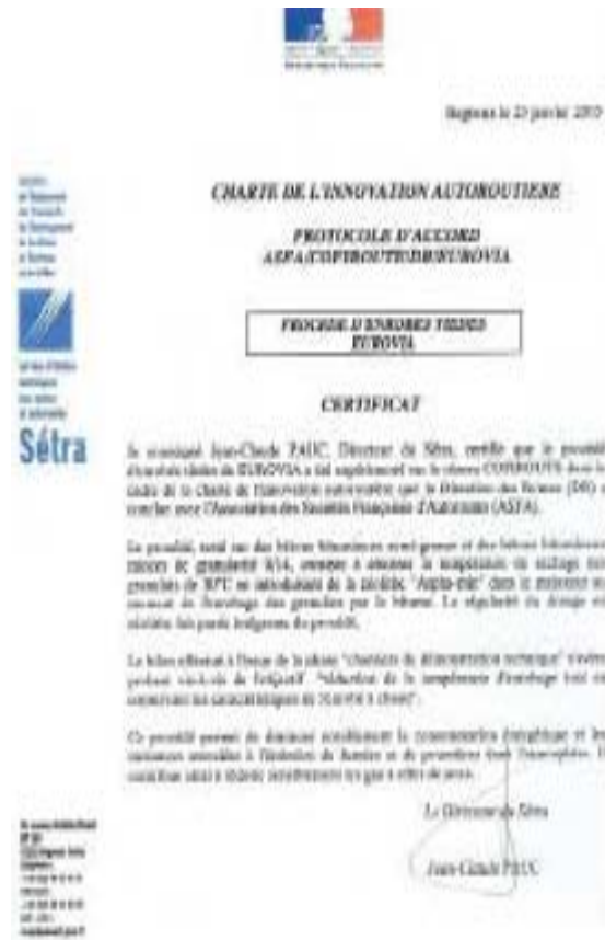
Figure 2. Aspha-min SETRA Certificate.

In France, new innovations for road authorities are evaluated by a partnership between the developer (often a contractor) and the road directorate. SETRA, Service of Technical Studies of the Roads and Expressways, represents the road directorate. Both partners have to fund the evaluation. The evaluation process starts with a laboratory evaluation; if successful, field trials are undertaken, and then guidance papers are prepared for use of the product. The final step is to incorporate the product into existing standards or develop new ones if no applicable standard exists. Trial sections are constructed along with a control section, each a minimum of 500 meters long. Trial sections are monitored for a minimum of three years. Typically, at least three trial sections are used to evaluate a single product, and a certificate is awarded at the end of a successful evaluation. The certificate technically validates the product and provides guidelines for the product's use. Certificates are often used by contractors for marketing. In 2007, Aspha-min zeolite was awarded a